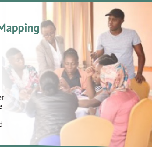
Civil Society Organisations at the Advocacy Workshop in Nairobi, March 2020

Another approach that can also be helpful is mapping out the planning and budgeting processes within a country or context as well as which decision-making spaces are open to CSOs influence, in order to understand when, and at what level, the government may have the ability to take on board solutions and create change; and thus, where advocacy is most effective.